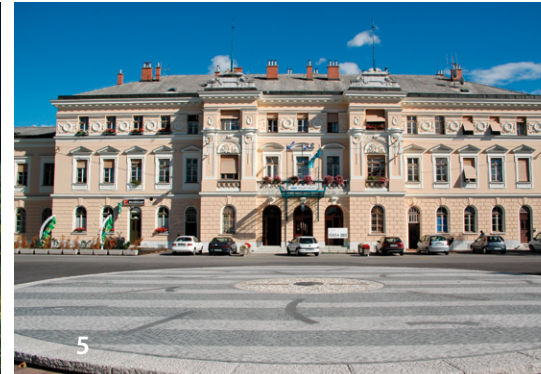
5 Nova Gorica - Gorizia, Europa Square